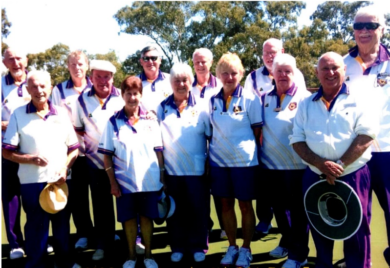
2021/2022 Saturday Pennant Side 3, Division 7, Section 5