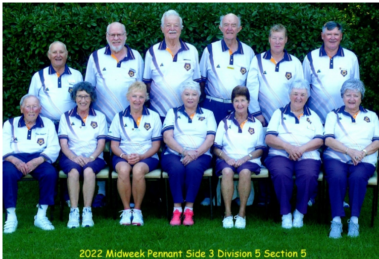
2022 Midweek Pennant Side 3 Division 5 Section 5

2021/2022 Midweek Pennant Side 3, Division 5, Section 5